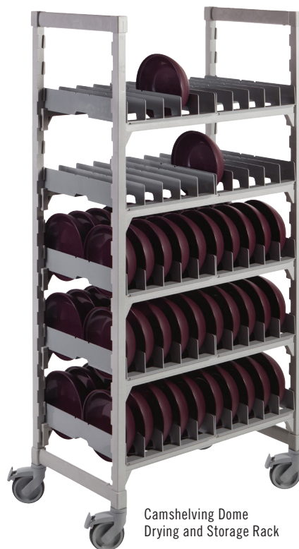
Camshelving Dome Drying and Storage Rack

Mobile unit ships in 9 boxes with 2 unassembled mobile post kits, 10 traverses, 10 dome drying cradles and premium swivel plastic casters with total locking brake.