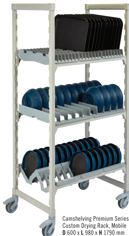
Camshelving Premium Series Custom Drying Rack, Mobile D 600 x L 980 x H 1790 mm

Mobile unit ships in 9 boxes with 2 unassembled mobile post kits, 10 traverses, 10 dome drying cradles and premium swivel plastic casters with total locking brake.