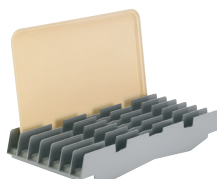
Vertical Drying and Storage Cradle is covered by U.S. Patent D 663,912 S.